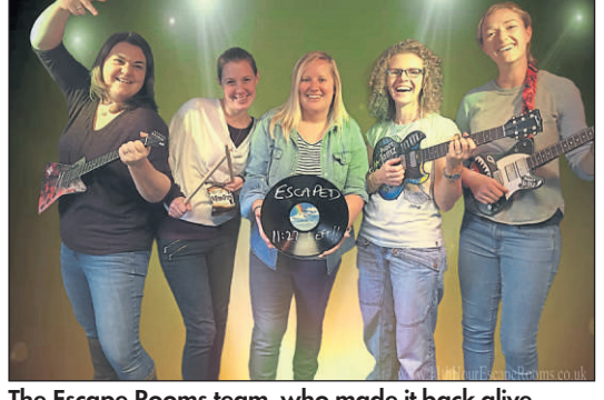
The Escape Rooms team, who made it back alive....

Bromham is the home of the newly opened 11th Hour Escape Rooms, north Wiltshire's only Real Life Escape the Room Game for over 18's and this week we are offering Wiltshire Times readers the chance to try it out with a 15 per cent discount voucher, a perfect early Christmas gift or fantastic change from the usual office party if you run a small business. Prices start from £13 for parties of between