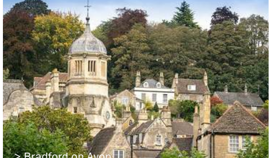
> Bradford on Avon