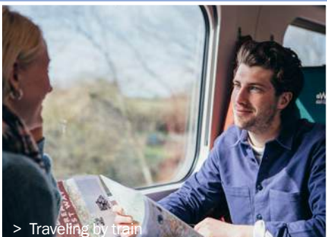
> Traveling by train