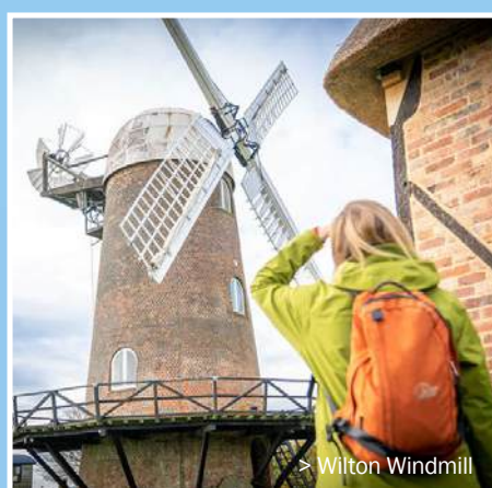
> Wilton Windmill

Embrace the unfamiliar at GreatWestWay.co.uk