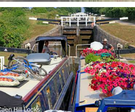
> Caen Hill Locks