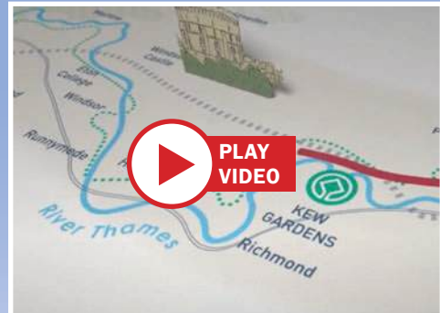
> Wilton Windmill