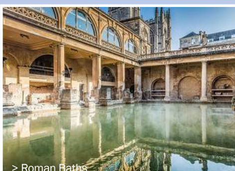
> Roman Baths

Along the Great West Way you'll encounter three National Landscapes – the Chilterns, the Cotswolds and the North Wessex Downs – and the UNESCO World Heritage Sites of Stonehenge and Avebury, Kew Gardens and Bath. You can visit the world's best preserved Roman remains in Bath. Watch the Changing of the Guard at Windsor Castle. Pootle along the Kennet & Avon Canal. Enjoy a wine tour at one of the many vineyards. Or soak in the UK's only natural hot springs at Thermae Bath Spa. Step aboard the last Concorde at Aerospace Bristol. Or stroll through 15,000 extraordinary trees at Westonbirt, The National Arboretum. Enjoy Newbury's canal-side pubs and restaurants. Discover Reading's Museum and Abbey Quarter. Trawl Hungerford's antique shops and fairs then sample seasonal produce at one of the traditional pubs along the route. Take a pleasure cruise along the Royal River Thames. Unearth amazing archaeology at the Roman Baths. Stand on the site of the seeping of Magna Carta at Runnymede. Or visit a delightful National Trust property.