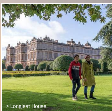
> Longleat House