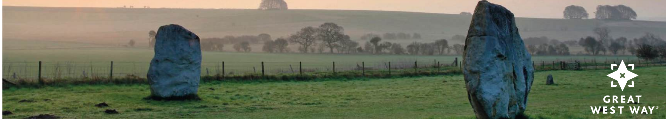
> Sunrise at Avebury