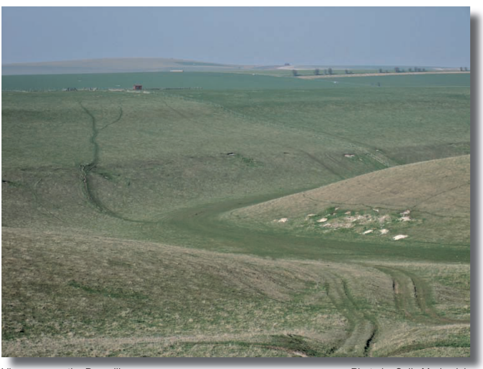
Views across the Deverills

12-14 There is a cross road of tracks at point 12 and you will want to turn right, there is some badger activity around this area so take care and watch for any holes. Follow this track all the way to point 13 where you will need to go through the gate on your left to the road. Turn right onto the road and follow it to point 14.